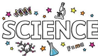
Figure 1: Highly accurate representation of science. Your figure captions should be formatted in an embedded style as well.

Insert image(s) below the abstract section. Photo/figures must be your own and cannot be taken from primary research papers. High resolution (300 dpi) are preferred. For video submissions: insert display photo below (no caption required) with video name above this photo, submit video here using the video name as the file name, and email bbscatalyst@gmail.com with the video name in the subject line.