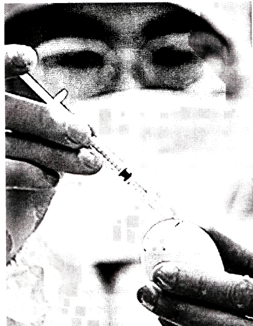
Figure 2: Avian Flu vaccine development is a pressing issue (Tribune, 2005).