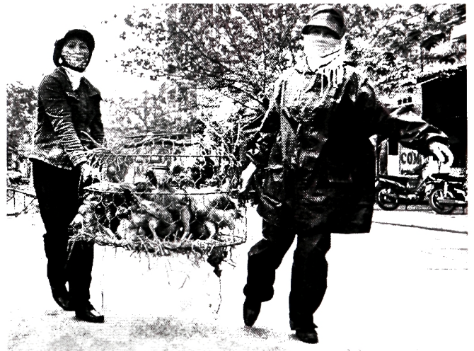
Figure 1: With the rise in cases human infections and deaths, these Vietnamese women protect themselves from the Avian Flu (US Department of State, 2005).

preventing influenza infections and reducing the severity and duration of flu symptoms. In the event of a pandemic, they will play an important role in limiting sickness and death. Trials are desperately needed in order to assess whether these drugs work better alone or in conjunction with one another (CBC News Online, 2005). For maximum effectiveness, Tamiflu and Relenza should be administered within 48 hours of infection. They may also improve prospects of survival in human infections if administered early, but clinical data for this is limited (WHO, 2005).