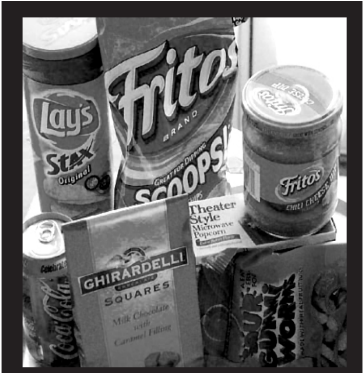
Obese individuals tend to gain weight as they wait for their surgery, increasing their risks of complications during surgery

As more baby boomers reach retirement age, the need for doctors and treatments continues to intensify. As a result, doctors are required to use their medical expertise to