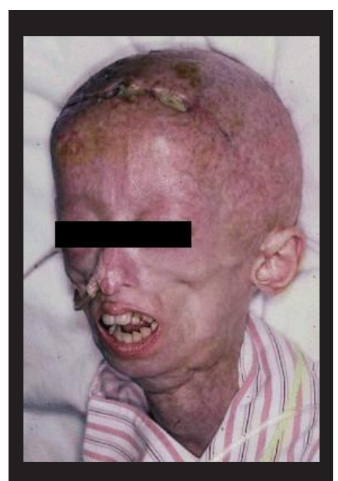
Figure 1 A 15-year-old HGPS patient exhibiting sunken cheeks, narrow nose, and protrusion of eye sockets.

erived from the Greek word meaning "prematurely old", progeria denotes a group of disorders that impart signs of