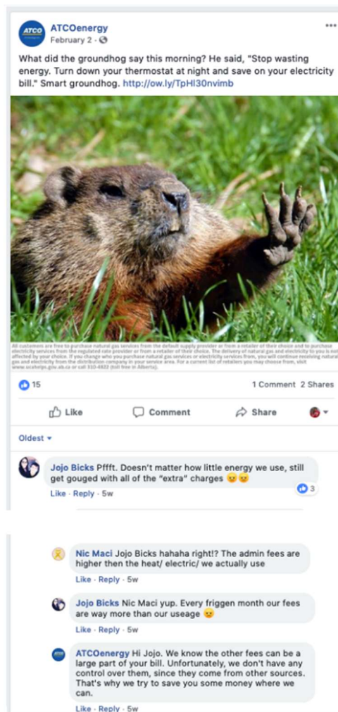
Figure 2 ATCOenergy. (2019, February 2). What did the groundhog say this morning? He said, "Stop wasting energy. Turn down your thermostat at night and save on your electricity bill." Smart groundhog. http://ow.ly/TpHl30nvimb [Facebook Status Update]. Retrieved from: https://www.facebook.com/ATCOenergy/photos/a.1554877084834418/2213146849007435