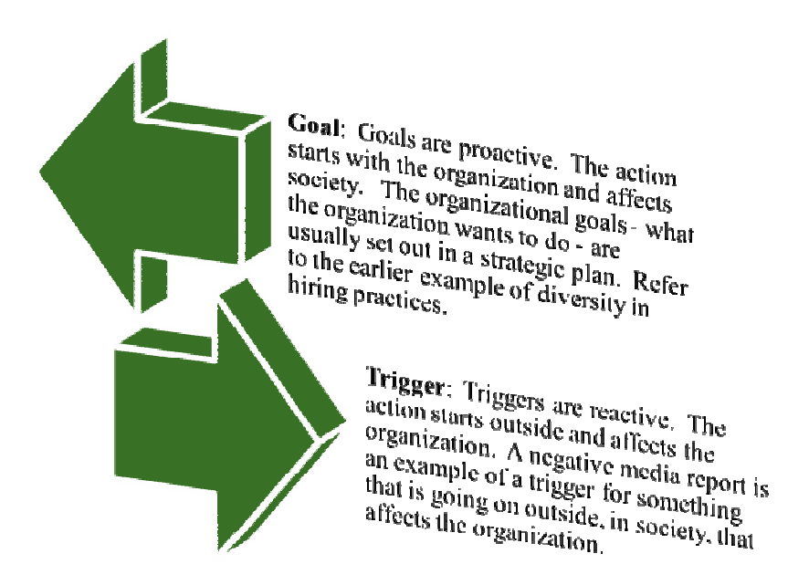
Fig. 4. Goals and Triggers

There are three parts to TESICC. Given that planning does not always receive the support it needs internally, it is important that any management tool allow for a fast, uncomplicated assessment of a situation. The first part only identifies goals and triggers for an organization so if the practitioner wants to move ahead in the communications or business plan at this point that is perfectly acceptable. However, some practitioners wish a deeper level of analysis. They may wish to consider possible outcomes for goals and triggers in isolation from the overall strategy. They may find the number of goals and triggers overwhelming and may need to find a way of prioritizing them. In each case, TESICC allows the practitioner to consider more information, as needed. In this way, the management tool scales to the level of complexity appropriate to the resources allocated for planning.