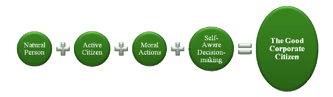
Fig. 2. The Good Corporate Citizen

The objective is not to override individual beliefs or supplant them with corporate values, but to align the values of the individual and organization so that employee decision-making and actions at all levels can proceed from an authentic place. Finding that alignment through good leadership and a strong congruent system of values makes it easier for an organization to be self-aware when making choices about the kind of citizen it will be.